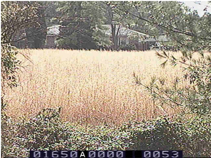
Last Photo Update 01/10/1997