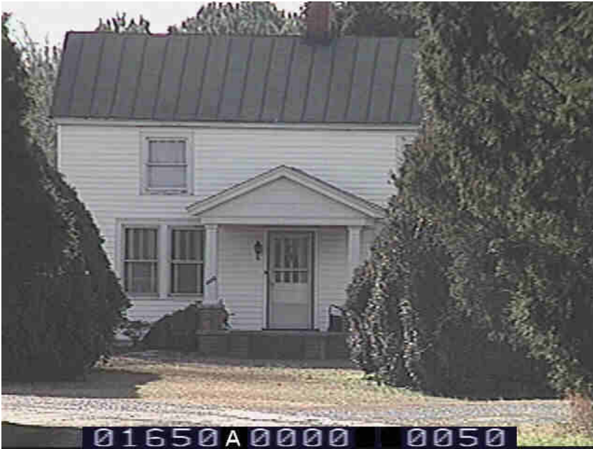
Last Photo Update 01/10/1997