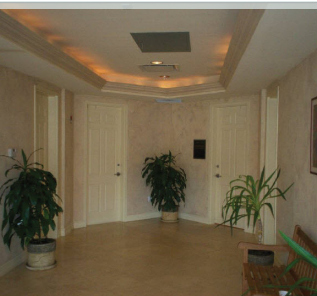
View of the common lobby.