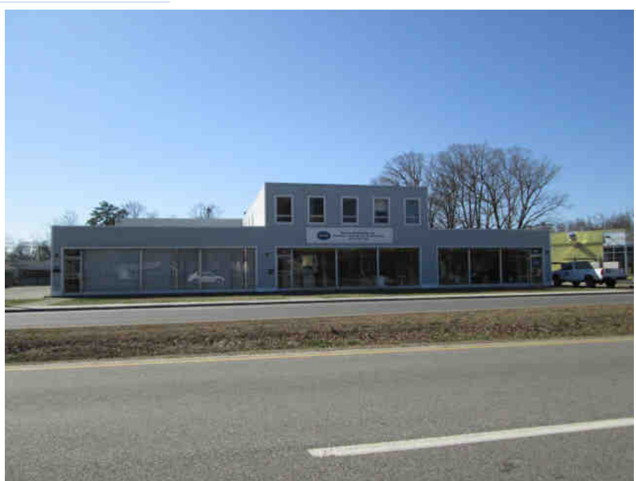
Last Photo Update 03/17/2014