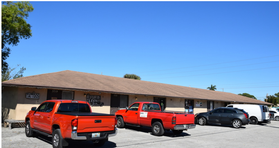
3719 S. Military Trl - Additional Income-Producing Property Possibly Available