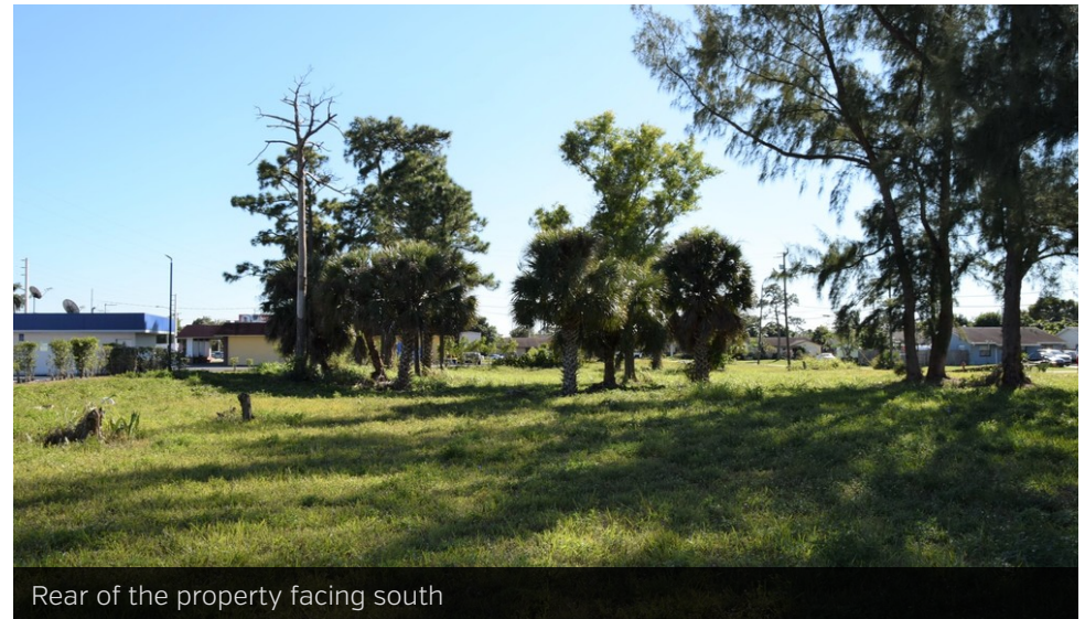
Rear of the property facing south