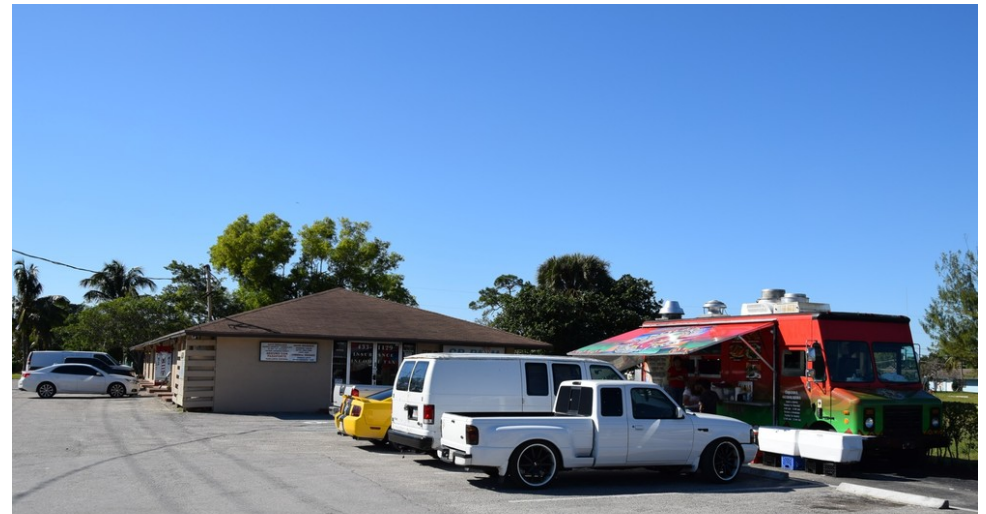
3719 S. Military Trl - Additional Income-Producing Property Possibly Available