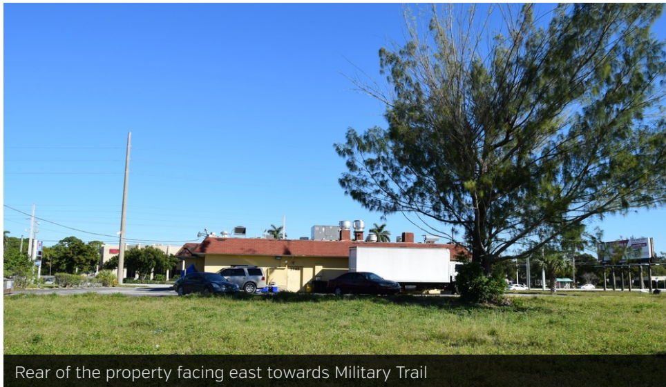
Rear of the property facing east towards Military Trail