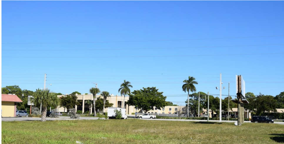
Facing east towards Military Trail