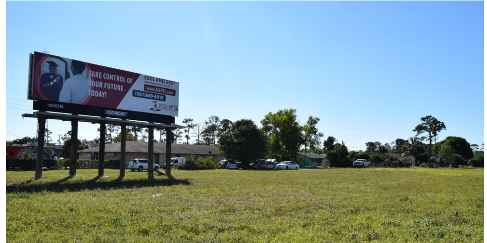
Additional Income from Billboard