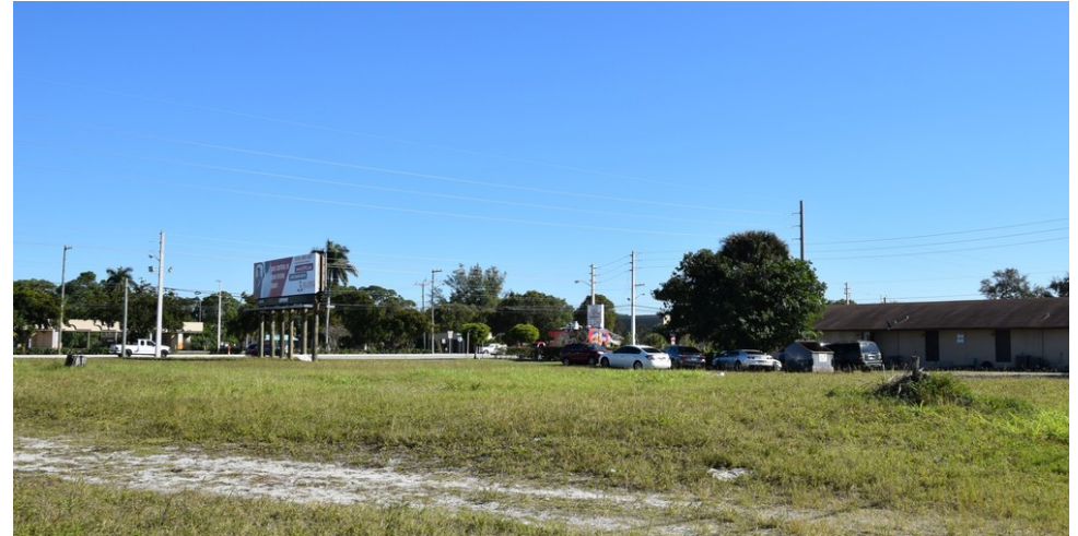
Facing east towards Military Trail