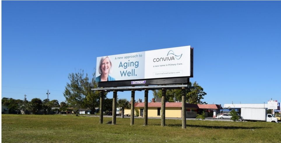
Additional Income from Billboard